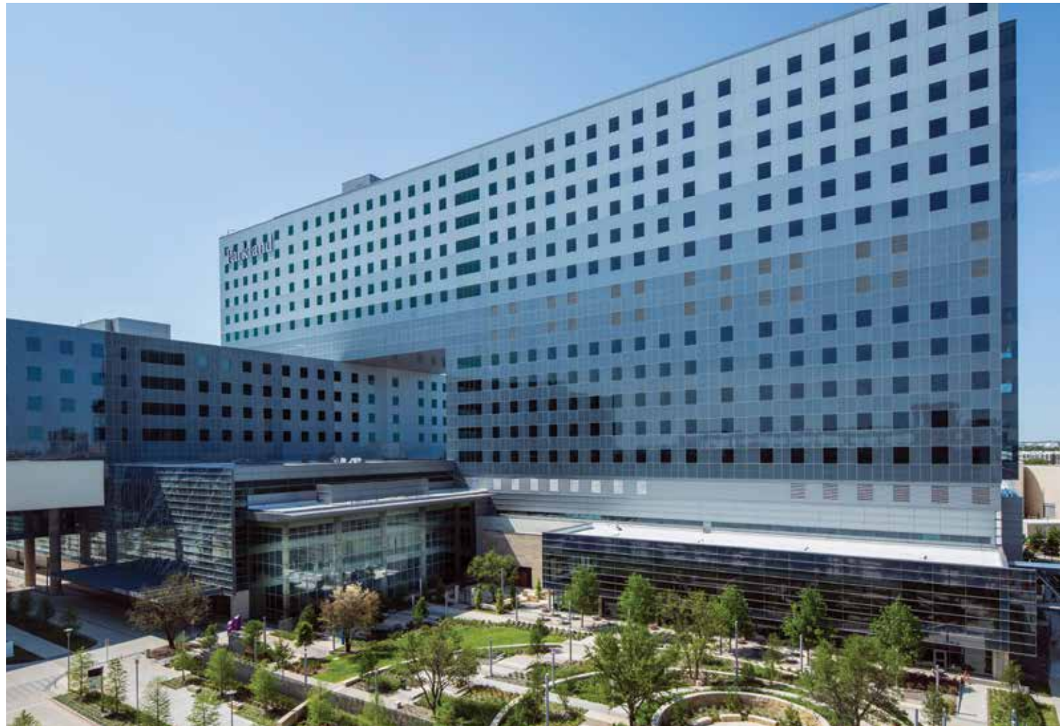
Parkland Memorial Hospital. LEED® Gold Certified / Dallas, TX